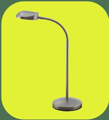
TABLE LAMP PAPAGENO- LA 005 PA